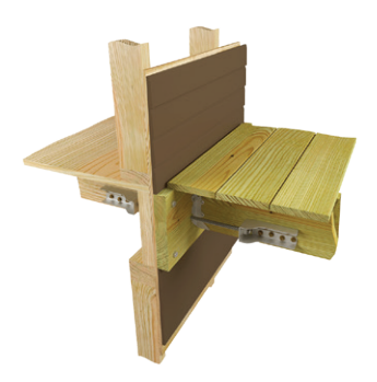
Typical DTB-TZ deck to ledger installation