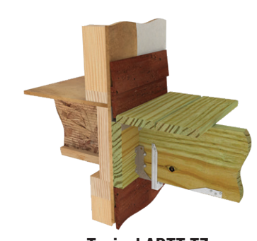
Typical ADTT-TZ flush installation Contracted Installation