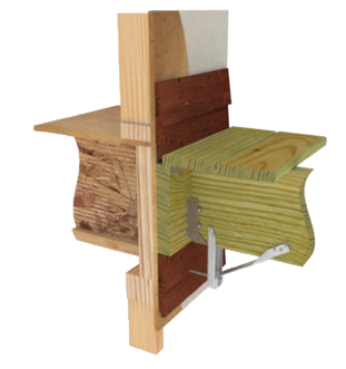
Typical ADTT-TZ full extension installation Extended Installation